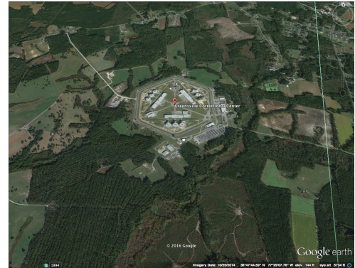
Google Earth 3D Image

Property Size Acres 1121 acres GPS Coordinates 36.798686, -77.487318 Number of sites in Parcel 2 Annual Energy Usage (Parcel) 195,057 kWh Utility Provider Dominion