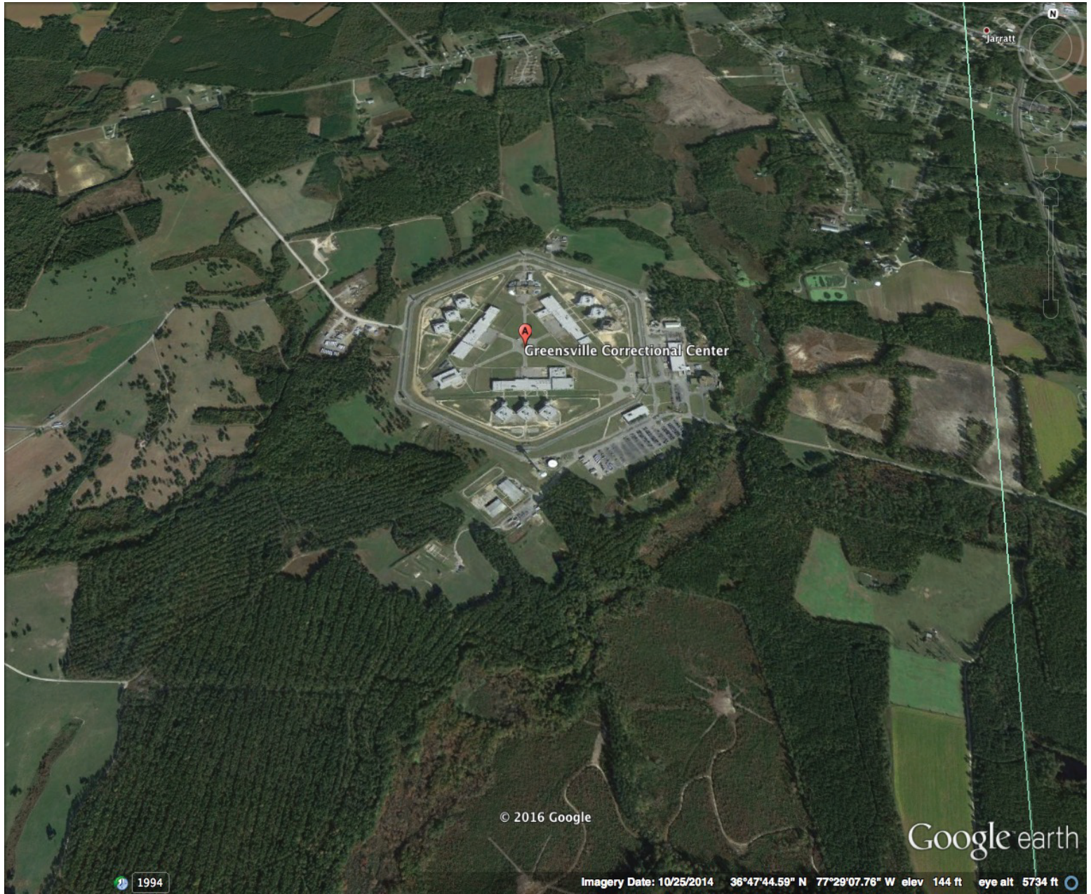
Google Earth 3D Image